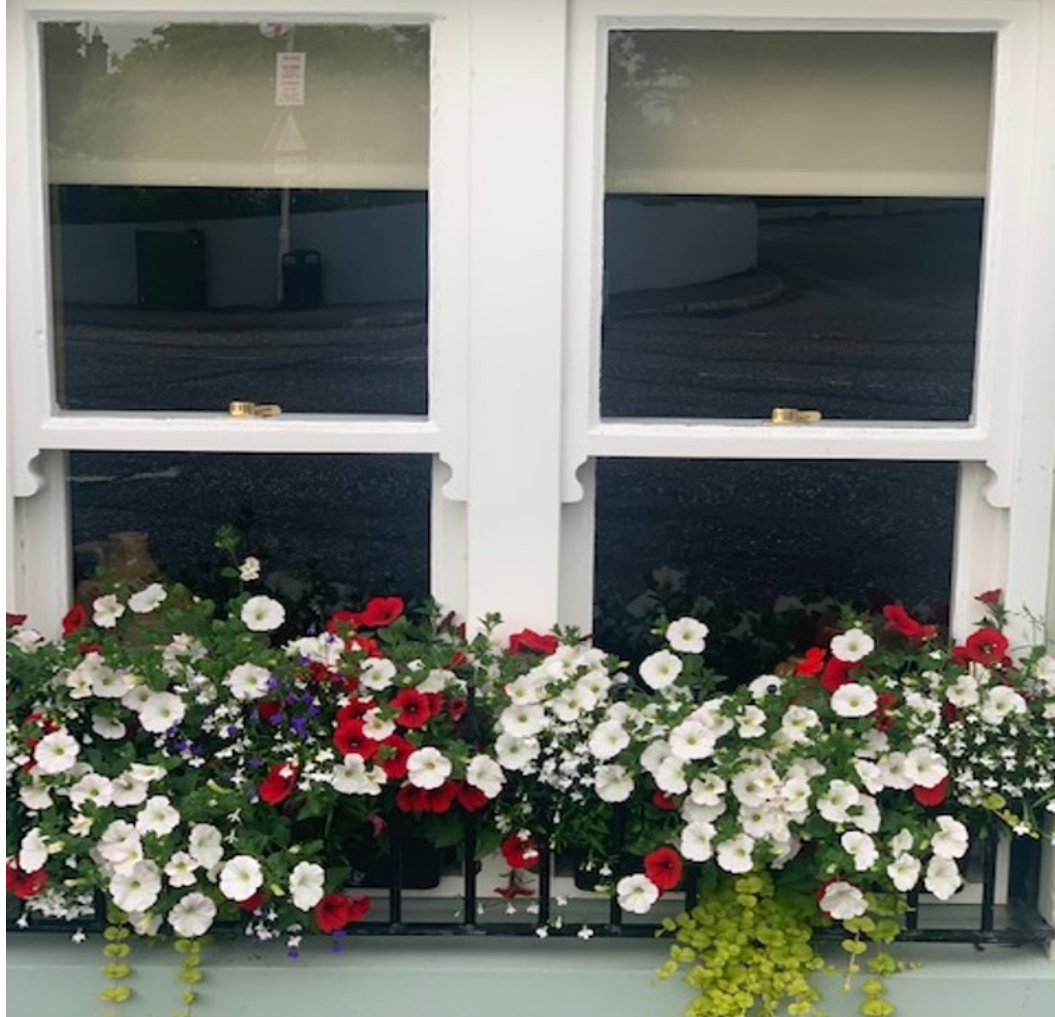
Basket Displays in The Square and Main Street